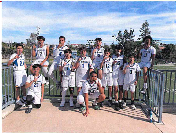
SBS Basketball Team Winners of CYO NAVY LEAGUE!