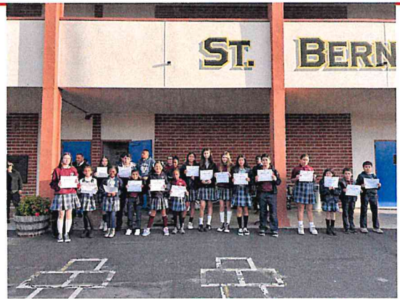
Congratulations to all our AR STAR READERS for reaching their goals!